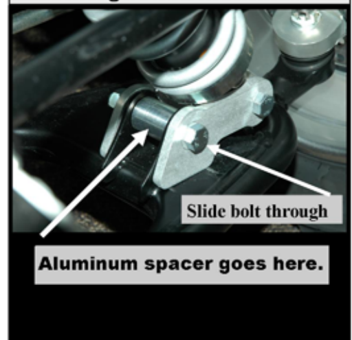
Front right side shock mount.

3) Start your installation with the placement of the aluminum spacer in the shock bracket on the A-arm. Place the two lowering kit plates on the outside of the shock bracket with the taper against the weld. Put a washer on the bolt and run your bolt through. Put a washer on the bolt and put your nut on hand tight. 4) Align the shock on the lower mounting holes and put your bolt through the holes. Put on a washer and then the nut. Now tighten both nuts on the upper and lower part of the lowering kit. Torque to 40 ft. lbs., plus or minus 3 lbs. 5) Repeat the same process on the other side.